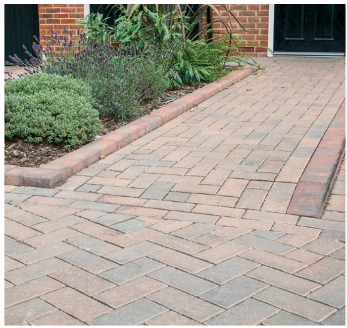
Formpave – innovators in permeable paving for over 20 years

Formpave has provided paving solutions to David Wilson Homes on a range of developments, using its design service to offer a bespoke solution that suits each project's criteria.