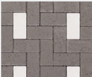
White / Ballotini †