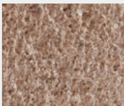
Cornish Silver Grey †