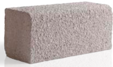
Ecogranite Centre Stone