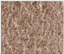
Cornish Silver Grey †