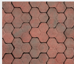
Red Brindle †