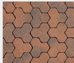
Golden Brindle †